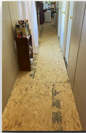
Before & after floor repair in a trailer on Wren Street after resident fell through the floor