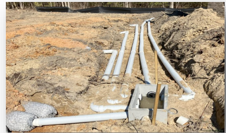
Sewer Line connection inspection at a New Single Family house on Moody Fox Lane