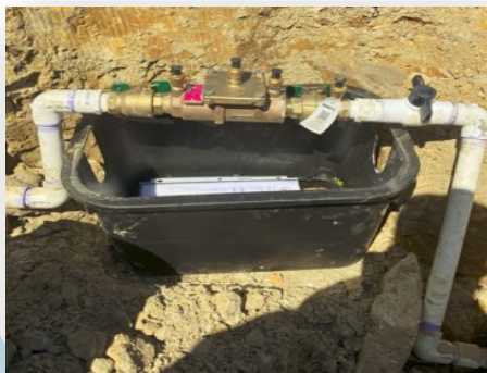
Backflow preventer on Norcum Avenue